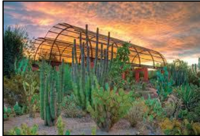
Desert Botanical Garden