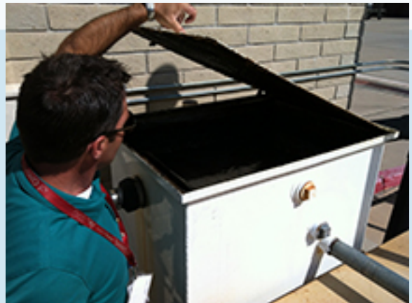
LAFB OWS Holding Tank for Aircraft Wash Rack

Overall, the initiative proved an effective approach and complete water resource sustainability.