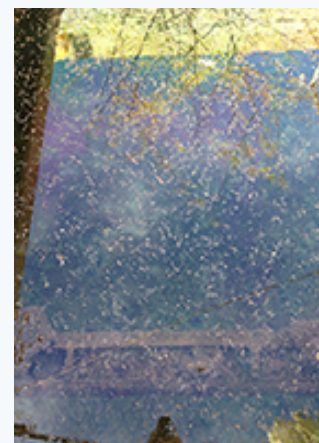
3-Months – After Treatment

Based on the results of this study, other entities or stakeholders would likely benefit from the bacterial synthesis to introduce fully sustainable wastewater and economically feasible uses. These may include: