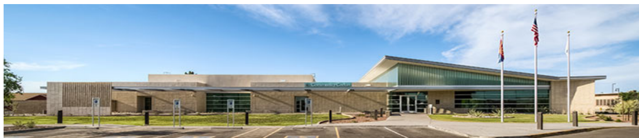
Figure 2 Community Center, by City of Peoria