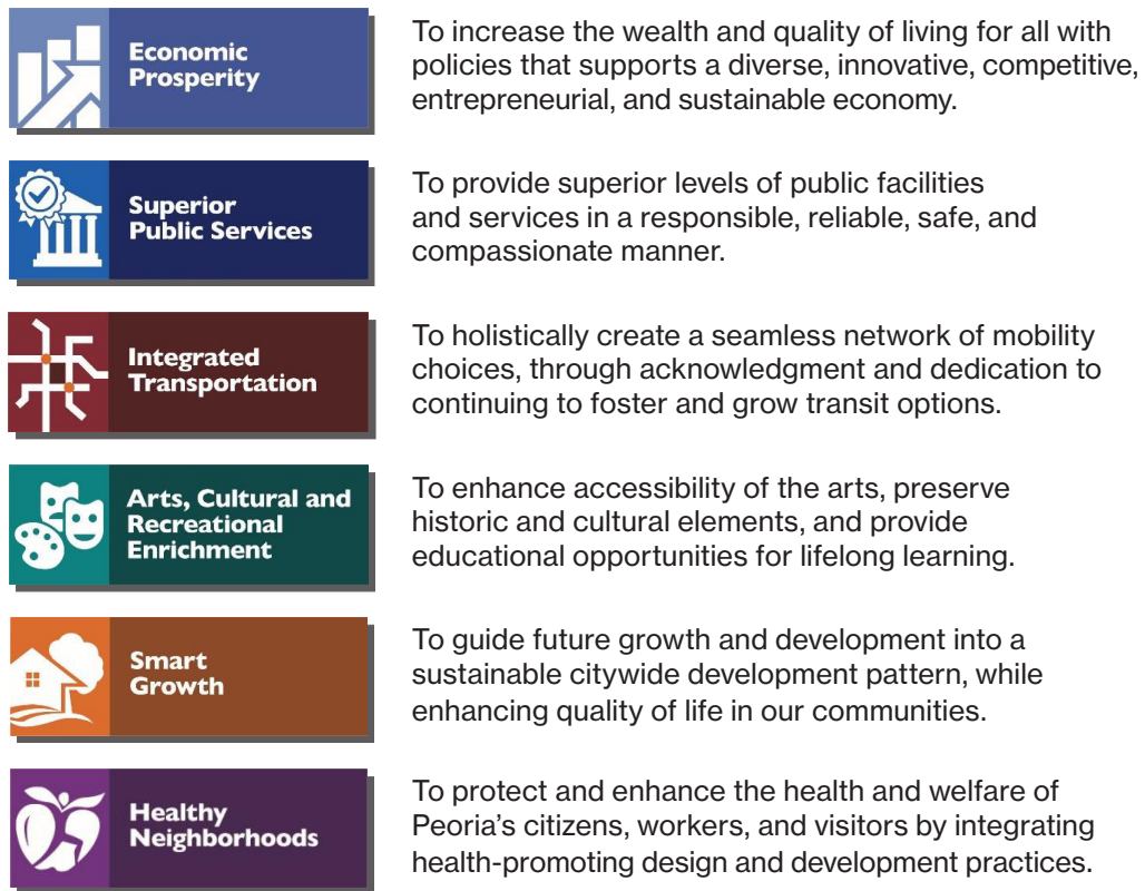
Figure 1 The six Livability Initiatives focusing on sustainable development

The City of Peoria has continuously demonstrated itself as a sustainable and livable community through its extensive offering of municipal services and forward-thinking planning. The City's Livability Initiatives establish a framework of six priorities for the City to guide its mission of "providing excellent municipal services by anticipating community needs," (City of Peoria, 2022). As one of the fastest growing communities in Arizona, Peoria's population continues to age, creating a need for the City to further develop its resources available for its senior population to ensure the well-being and active participation of the senior population in the community. In response to this need, the City's Neighborhood and Human Services Department is interested in developing a resource guide for its senior population that includes information about the City's health services, recreation programs, and classes, as well as how to be an active member of the community.