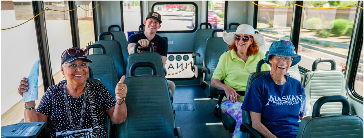
Figure 1 Peoria residents traveling by Peoria on the Go (POGO) bus