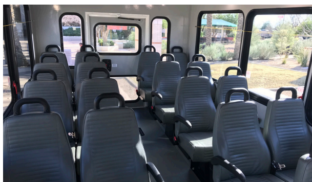
Figure 9 Peoria on the Go (POGO) bus (interior), by City of Peoria