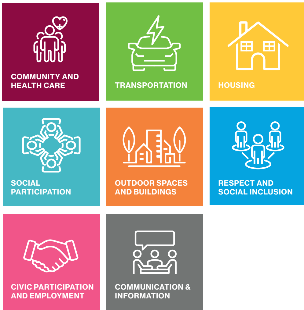
Figure 2 Eight interconnected domains for livability by City of Peoria