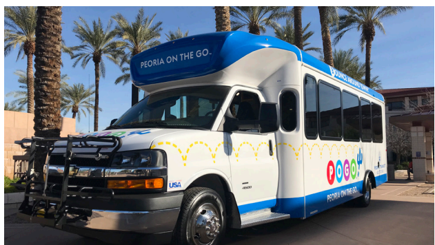
Figure 8 Peoria on the Go (POGO) bus