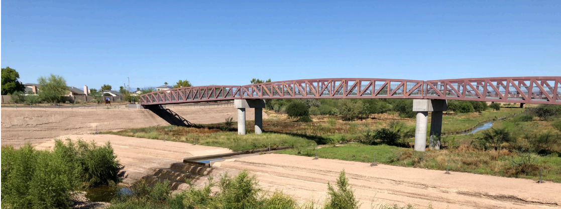
Figure 5 Skunk Creek Trail

With more than 30 parks and 20 miles of trails, Peoria offers outdoor recreation opportunities for people of all ages and abilities to enjoy the natural beauty. Peoria has neighborhood parks, community parks, hiking trails, fishing, and dog parks.