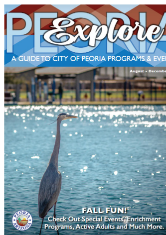
Figure 3 Peoria Explore cover, by City of Peoria