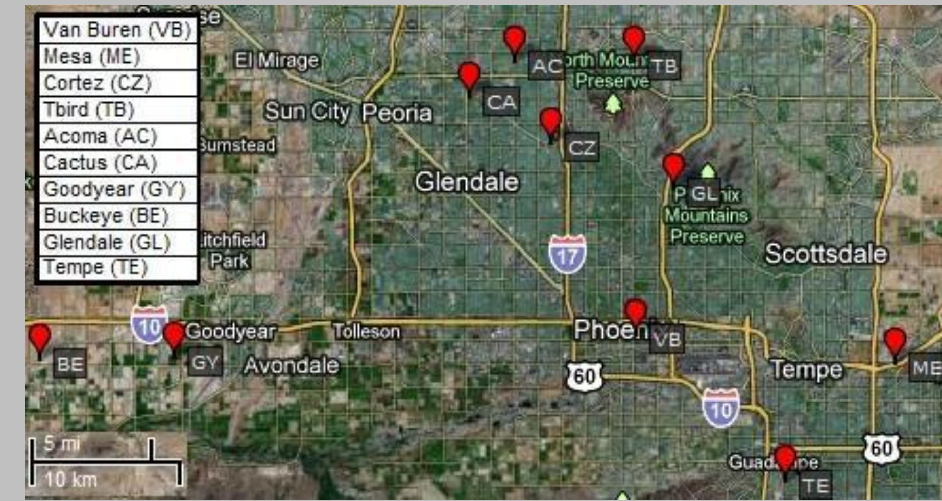
Fig 1. Black widow aggregations studied across Phoenix, Arizona (Map from Trubl et al. 2012).