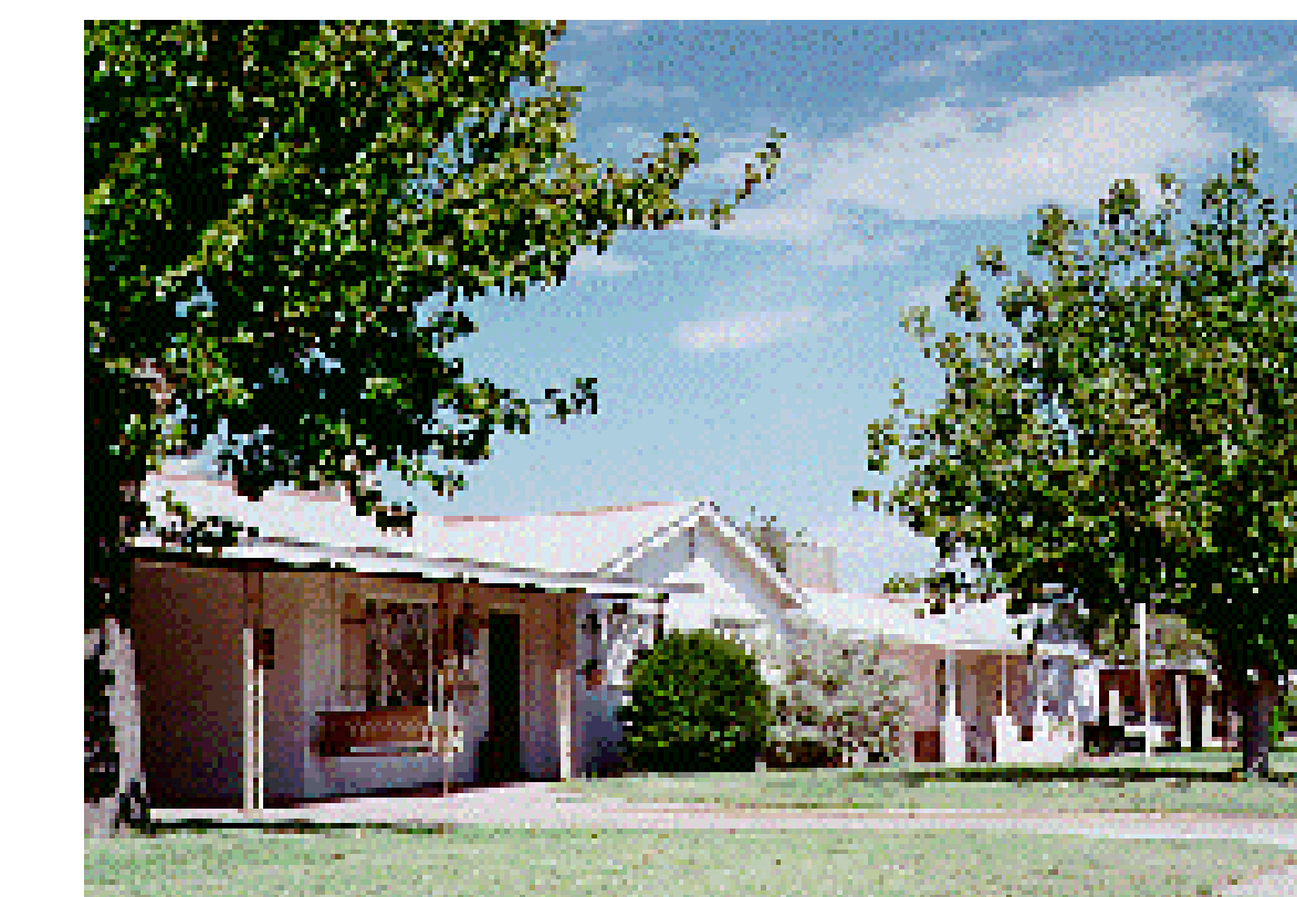
Canal Park est. 1950s to 1960s