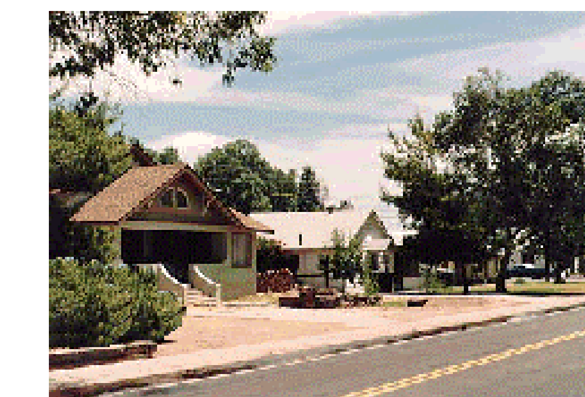
Riverside est. 1900s to 1950s