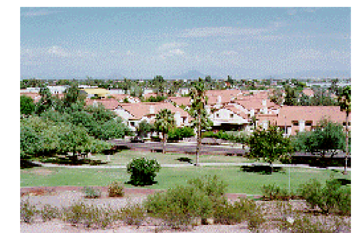
East Rio est. 1980s