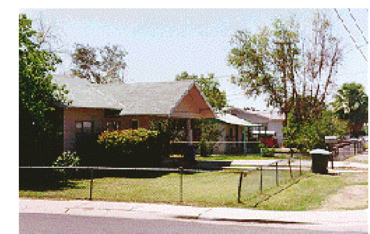
Jen Tilly Terrace est. 1940s to present