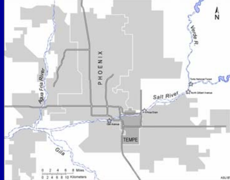
Figure 1: Map of Salt River study area. Markers were added to indicate study sites.

To counter the decline in riparian habitat quality associated with urbanization and modification of the flow regime of the Salt River, local and federal agencies have initiated several restoration projects. For example a habitat restoration effort, the Phoenix Rio Salado project, is in the works along a five mile section of the Salt River in central Phoenix, AZ (theriosaladoproject.org). A demonstration constructed wetland, the Tres Rios project, is present farther downstream west of Phoenix. Other restoration projects along the river are still in the planning phases. Many of these restoration projects are being planned and implemented without detailed investigation of the riparian biota, their functions, or the processes that drive community