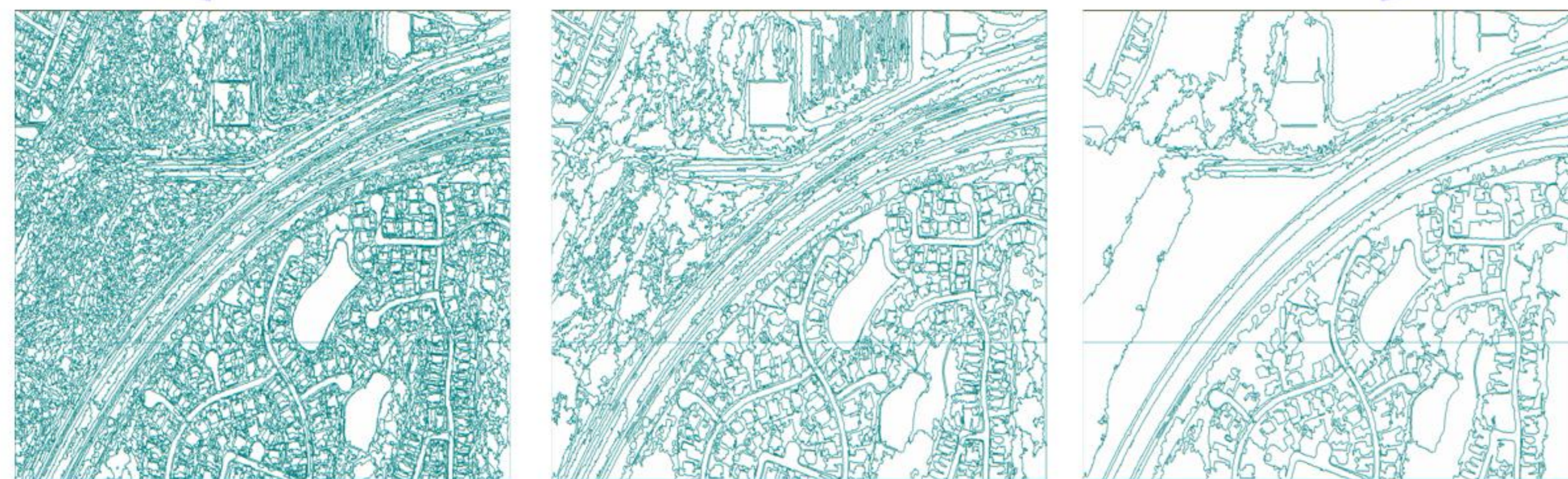
Figure 2. Image segmentation at varying scales. By analyzing spectral characteristics in concert with neighborhood dynamics, this process subdivides the image into discrete polygonal units at a user-defined scale. Classification is not done at this step. However once a classification is completed, it is possible to analyze objects of interest at their appropriate resolution, while simultaneously analyzing objects of other scales at their specific resolution.