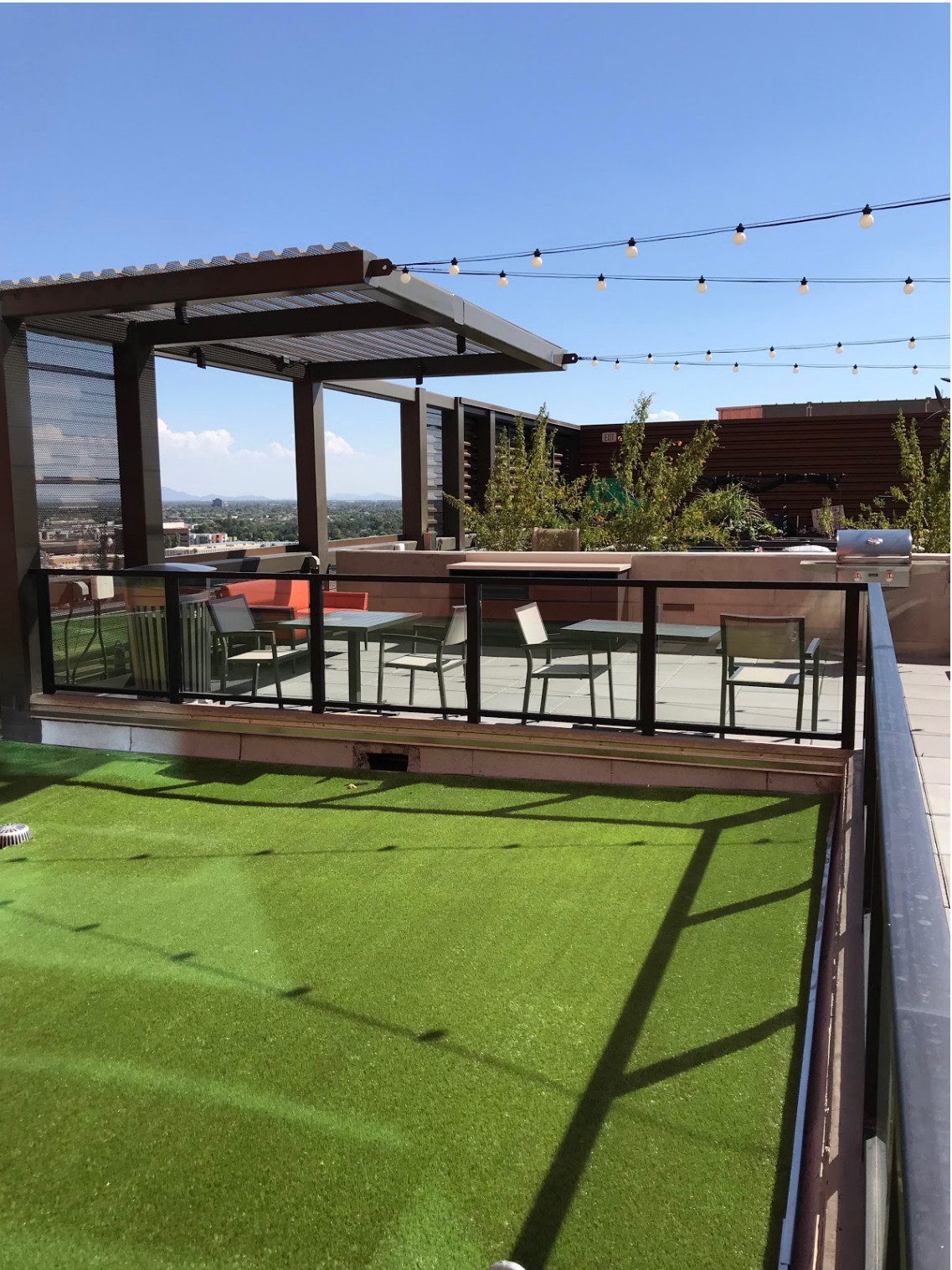
Mirabella at ASU Rooftop Amenity Space

Both objective and subjective methodologies will be used in this proposed research. Our objective measures include observing relevant meteorological data including air temperature, surface temperatures, humidity, wind speed and calculating mean radiant temperature (MRT). We will use stationary and mobile weather instruments. MaRTy mobile biometeorological cart will take transects to observe different portions of the rooftop amenity spaces of Mirabella at ASU. We will also adapt a method called a “heat walk” (Dzyuban et al., 2022) to pair MaRTy with a resident focus group to evaluate the rooftop spaces. A heat walk is a participatory action research data collection event where a community walks with MaRTy while answering focus group questions to identify and reveal new information about hot spots and cool places in their community - in this case a “heat rooftop walk”.