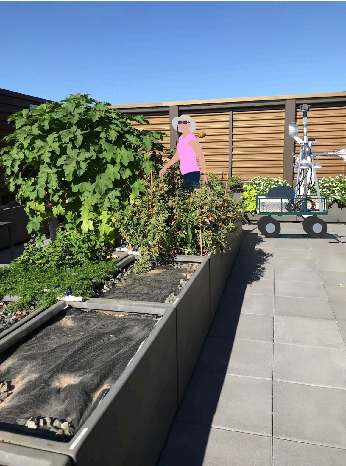
Rendering of MaRTy in Rooftop Amenity Space