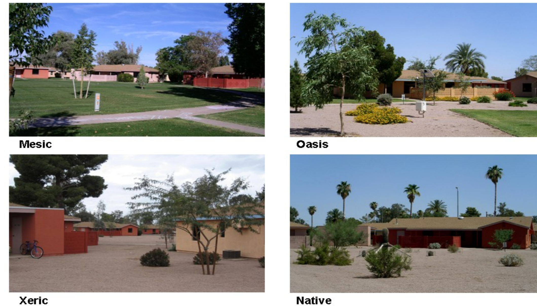
North Desert Village landscape design treatments

Residential landscape cover characteristics and ensuing microclimates created by the interactions of landscape surfaces with local atmospheres are predicated upon the designed arrangement of landscape elements, principally vegetation and ornamental hardscape features. In Phoenix there exists a wide range in the proportion of vegetation and ornamental hardscape features for any given residential landscape. At the CAP LTER North Desert Village experiment site on the ASU Polytechnic campus, I am studying the long-term effects of residential landscape design and ensuing above ground microclimates on below ground thermodynamics. Here I present a summary of landscape surface and below ground thermodynamics for the years 2007 through 2009.