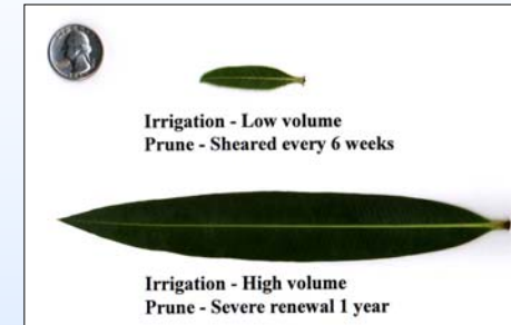
Figure 1 Comparison of leaves of Nerium showing two extremes in leaf area.