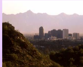
Trumble, T. Downtown Phoenix.