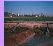
Brazel, A. Clean water, a provisioning service.

• What sources were used in assessing future feasibility?