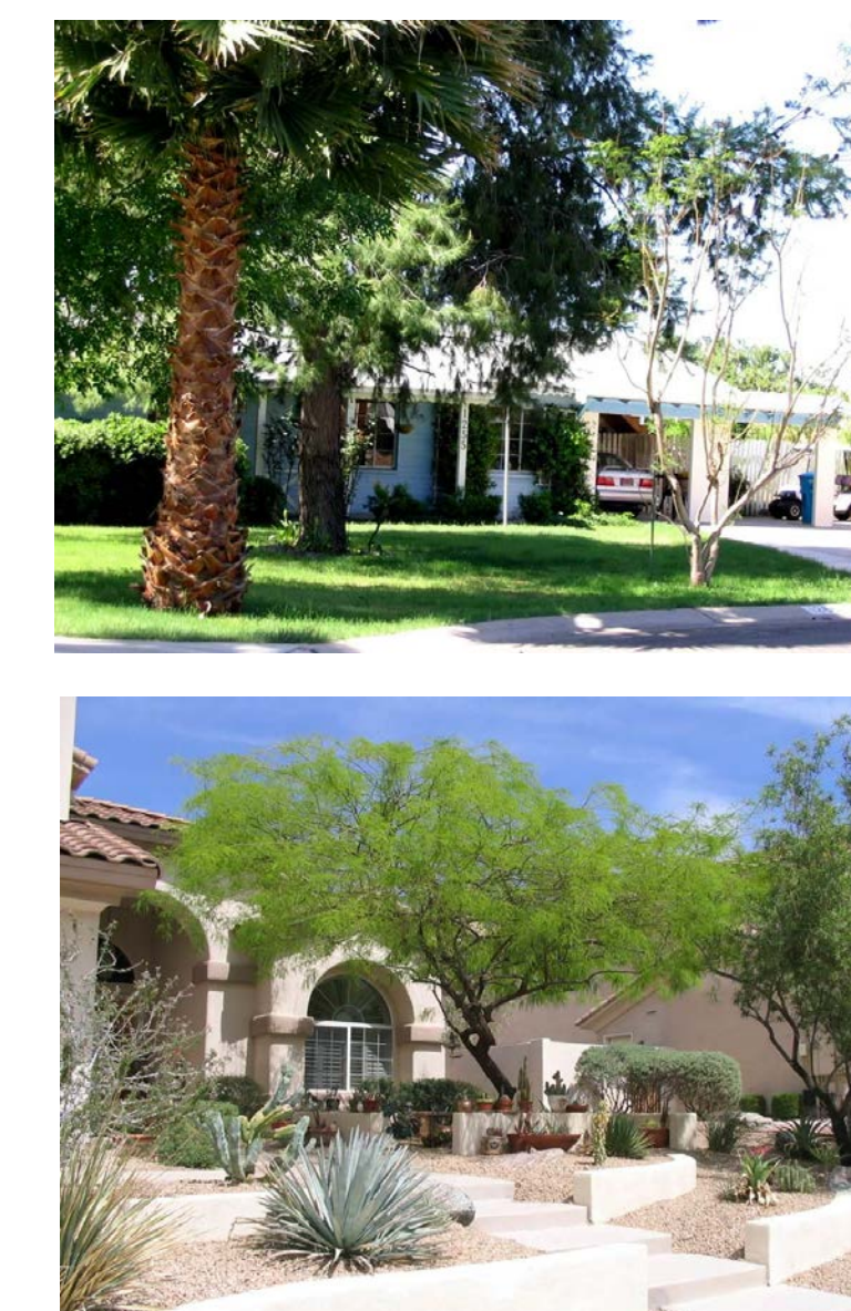
Figure 3. Mesic (top) versus xeric (bottom) yard types in the CAP LTER study system.