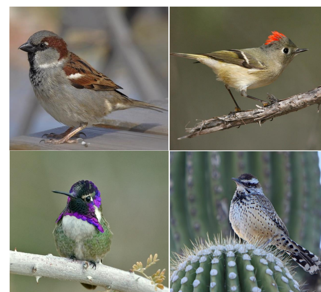
Figure 2. Select species from different habitat categories: House Sparrow (top left), Ruby-crowned Kinglet (top right), Costa’s Hummingbird (bottom left), and Cactus Wren (bottom right).