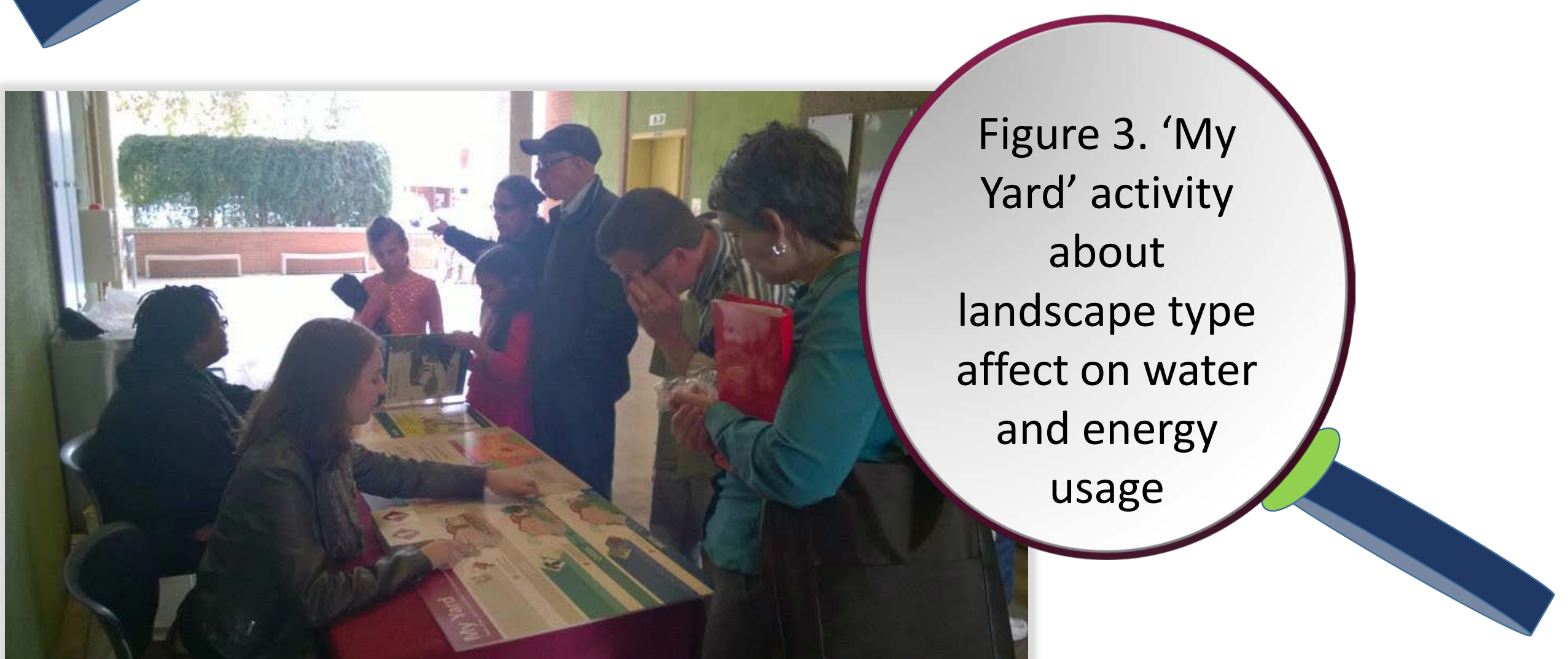
Figure 3. 'My Yard' activity about landscape type affect on water and energy usage