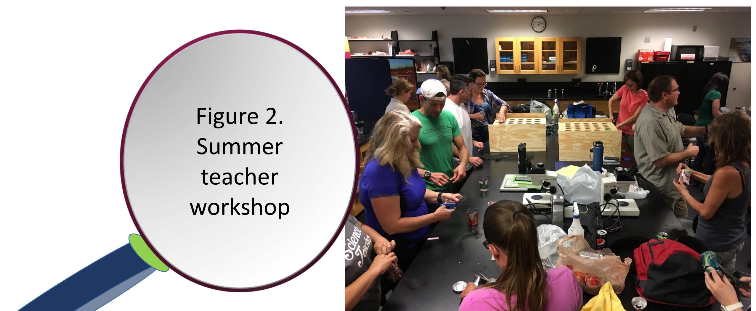
Figure 2. Summer teacher workshop