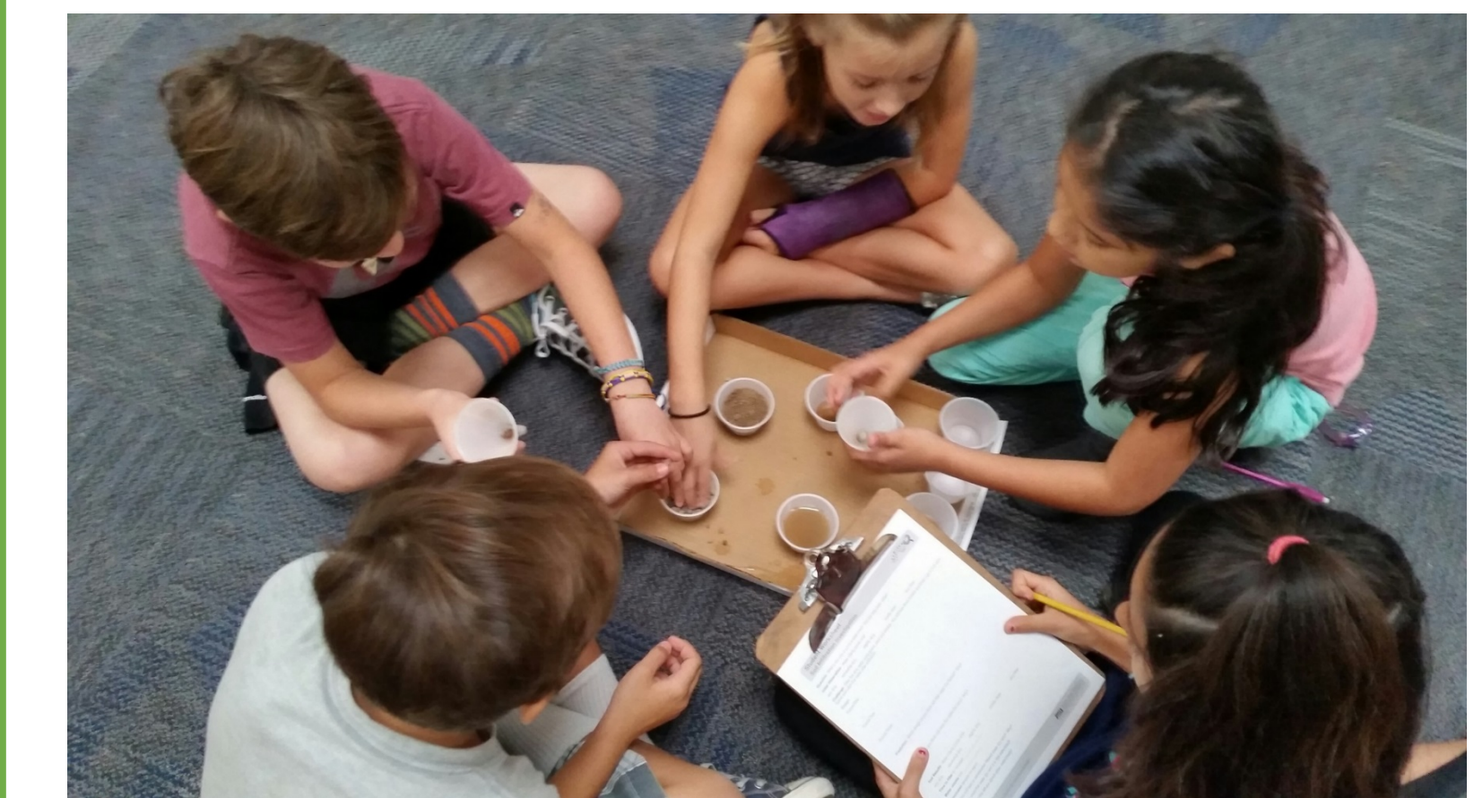
Figure 5. Students working on Nature's Water Filter Activity