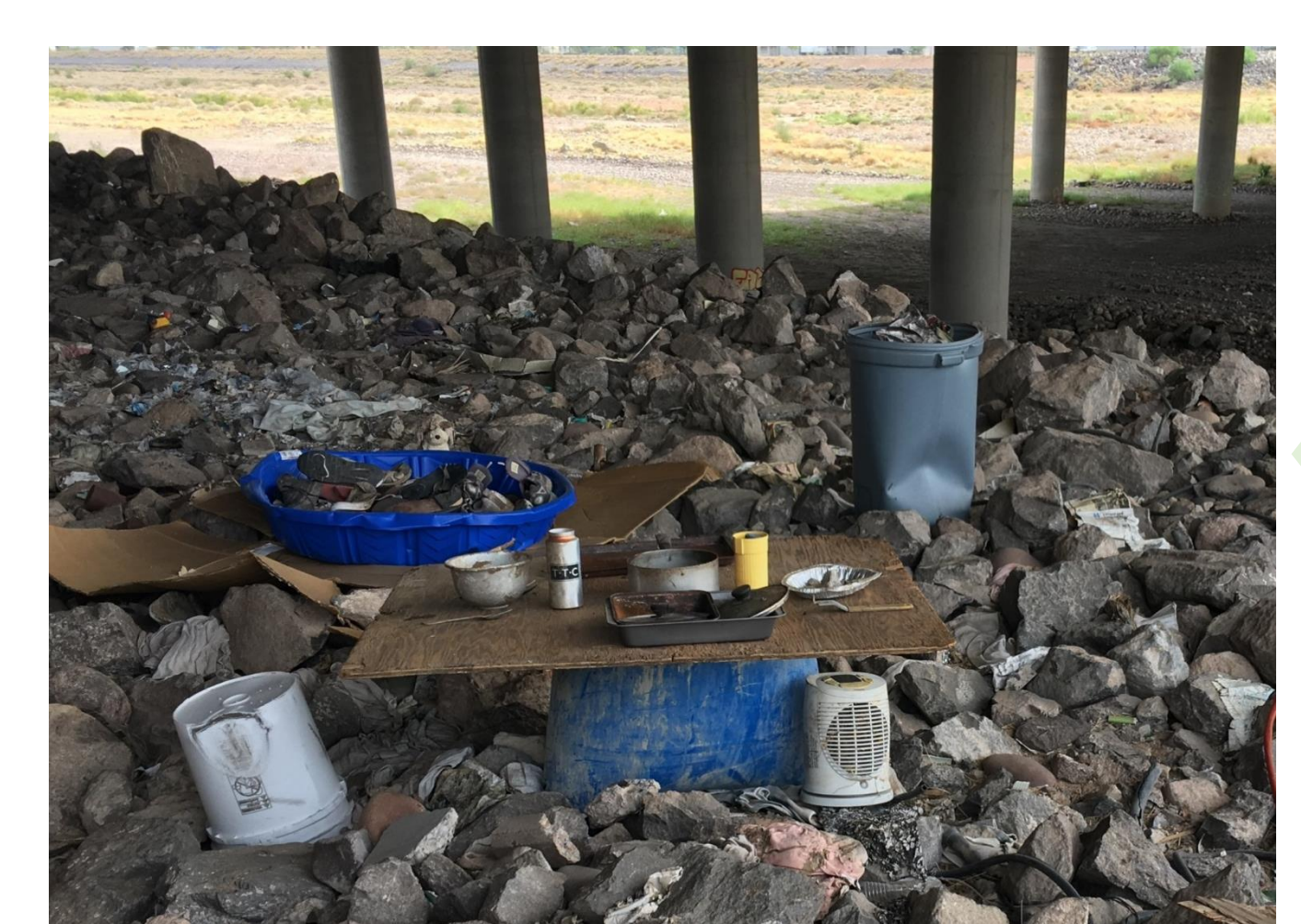
Figure 6. Kitchen area set up next to a stretch of the Salt River