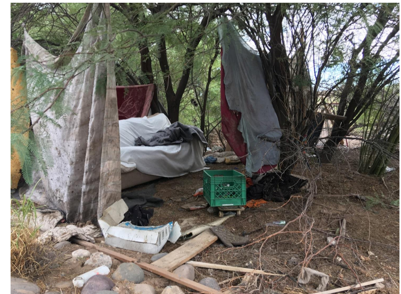
Figures 1 & 2. A camp set up in a hidden area (bottom) behind a wooded waterfall (top) in the Salt River.