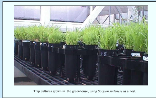
Trap cultures grown in the greenhouse, using Sorghum sudanese as a host.