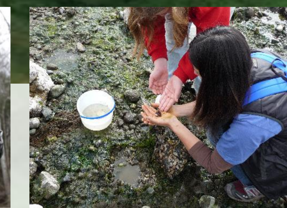
Citizen scientists, Tahoma Audubon