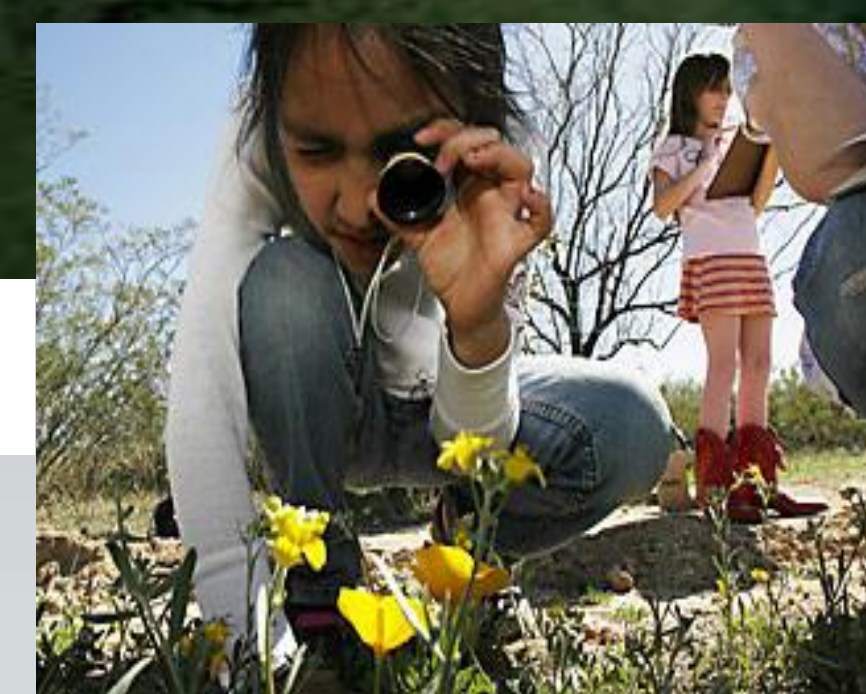
Budburst citizen scientist