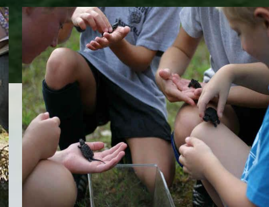
Citizen science education, NatGeo