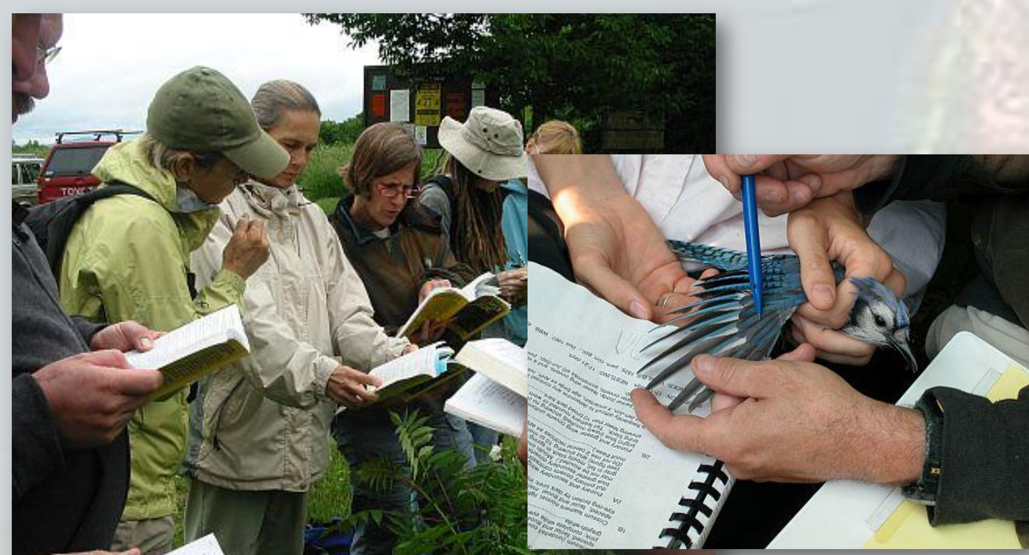
Citizen science training, AVEO 2011