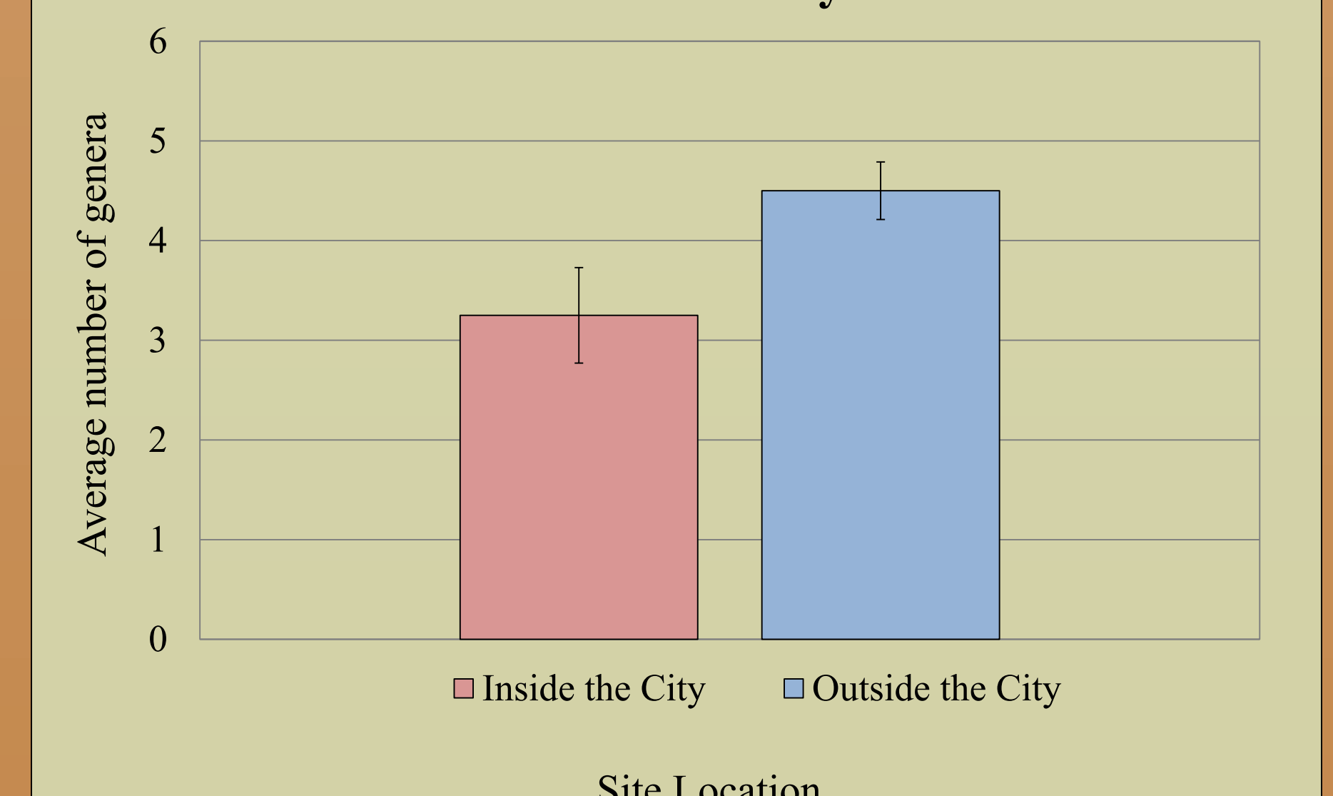
Graph 3: Average number of small rodent genera identified at rural and urban sites.