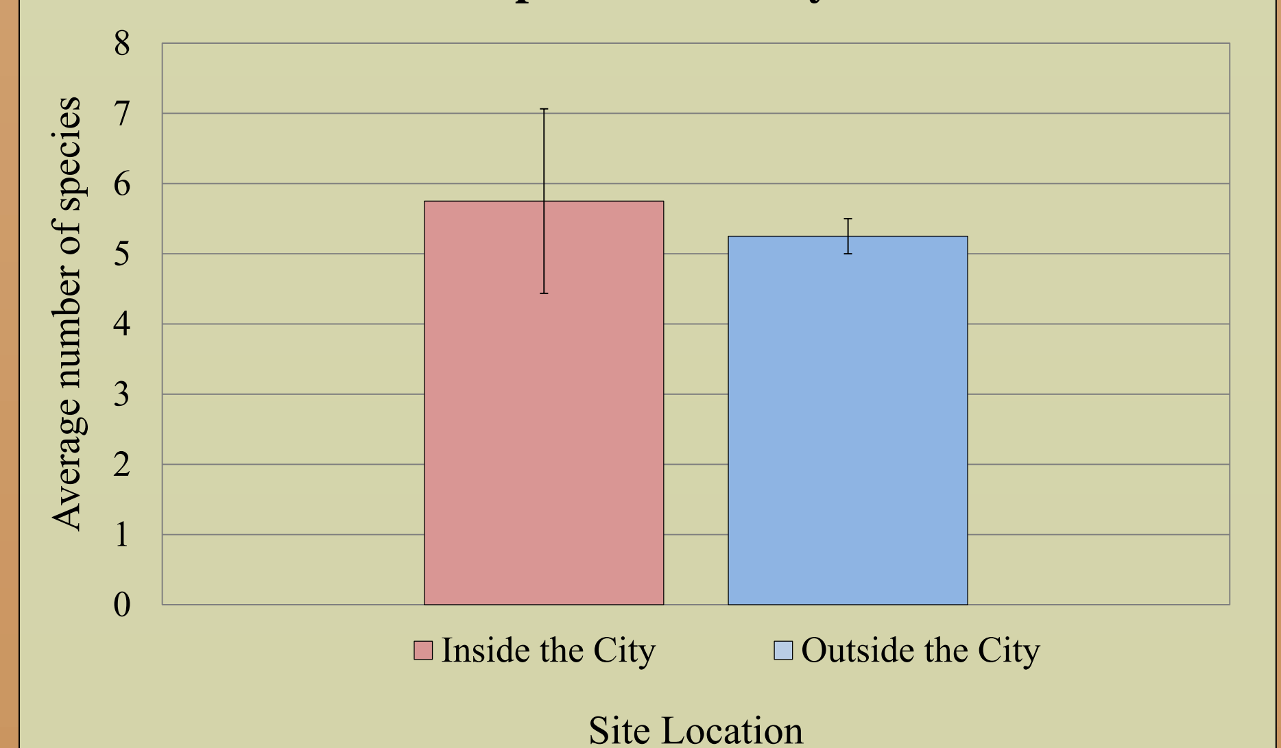
Graph 2: Average number of small rodent species identified at rural and urban sites.