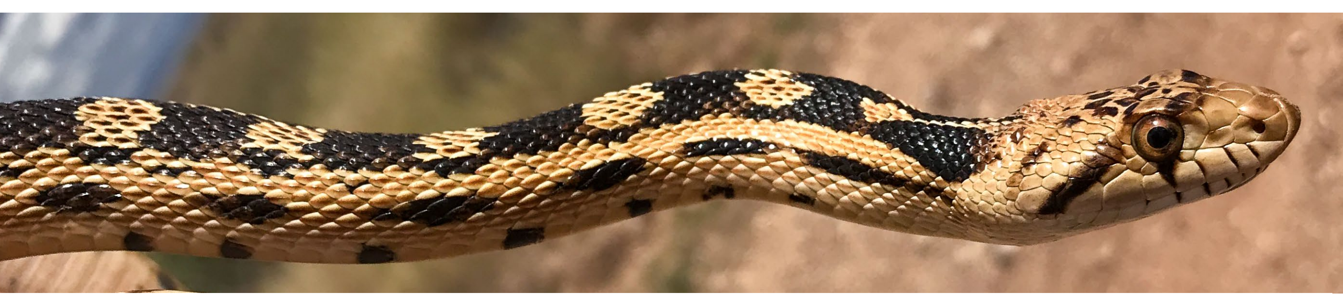
Gophersnake ( Pituophis catenifer )