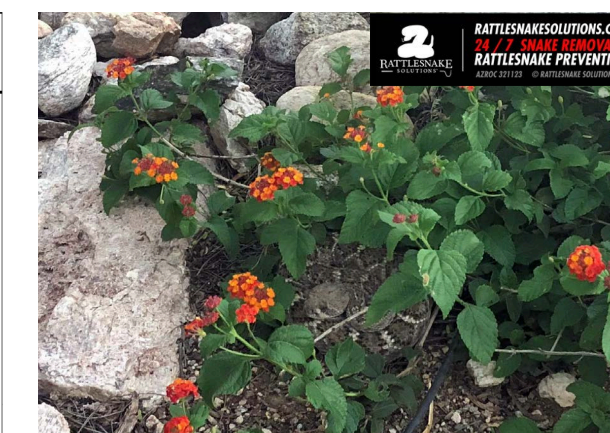
Rocks and vegetation provide low cover for a Western Diamond-backed rattlesnake in a suburban yard.