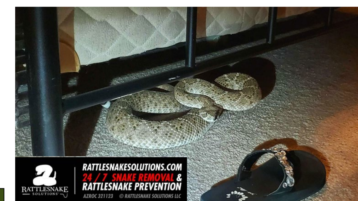
Western Diamond-backed rattlesnake ( Crotalus atrox )

A. Enloe 1 , J. Brown 2 , K.L. Larson 2,3 , and H.L. Bateman 1