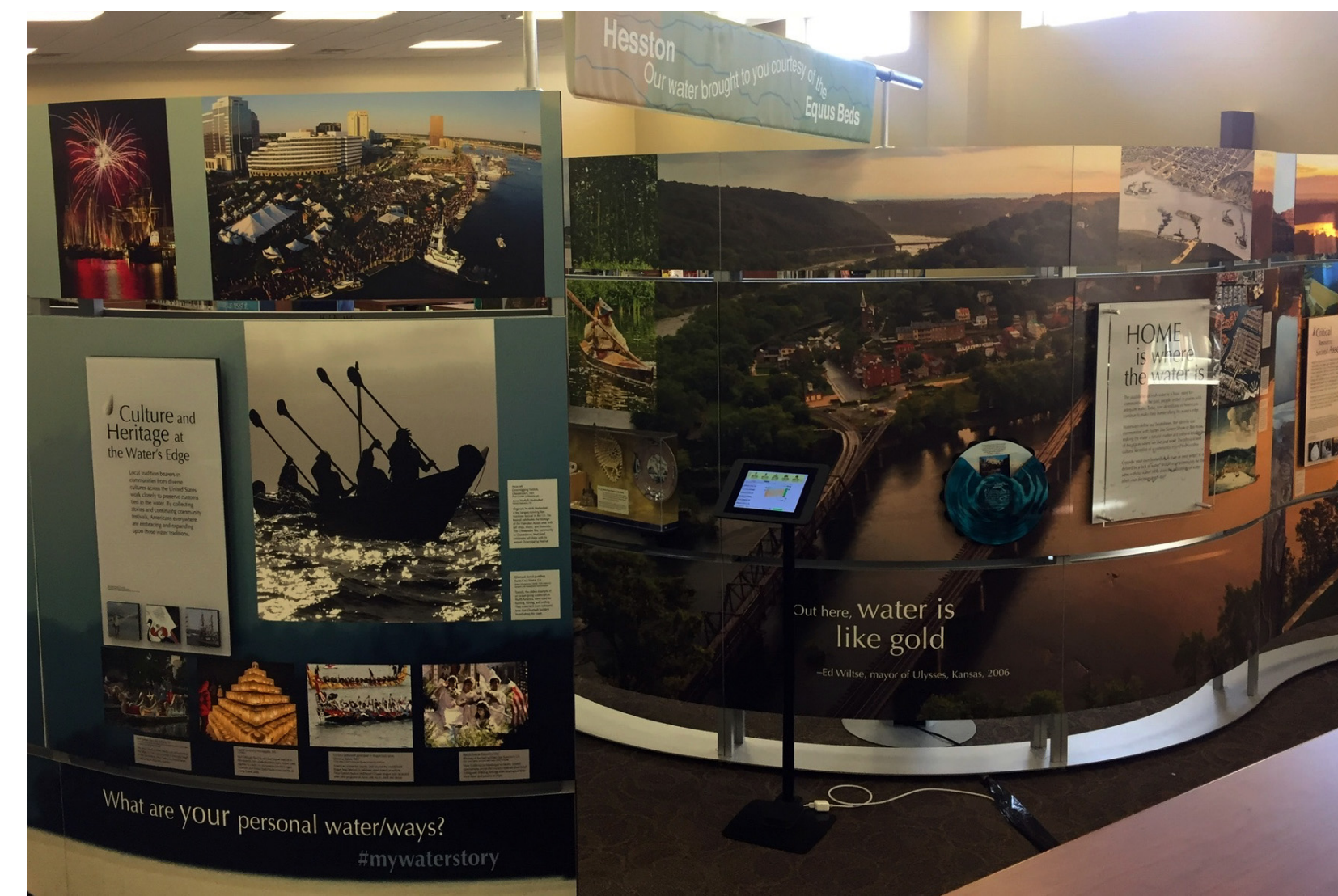
Water/Ways exhibition at Hesston Public Library in Hesston, Kansas

With the support of Arizona Humanities , the Smithsonian Institution , and the Arizona Community Foundation , we are inspiring Arizona's future young community leaders to become more aware of water issues, how the economy, quality of life, and natural environment are dependent on water, and what tradeoffs are needed to sustain the future of their communities. We do this by engaging with students utilizing state-of-the-art science and humanities tools, WaterSim America and WaterStories . DCDC's WaterSim America model is a unique hands-on, immersive visualization tool which explores the complexity of water supply and demand. Smithsonian Institution's WaterStories , engages rural youth in telling the cultural stories about the deeper meaning of water to their communities.