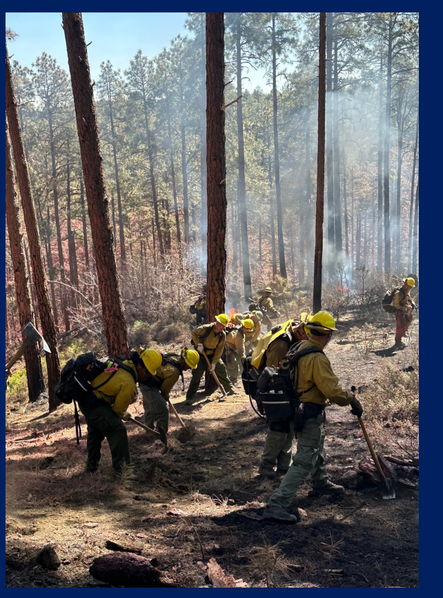
DFFM's Diablo Canyon crew on Towers Fire, north of Crown King.