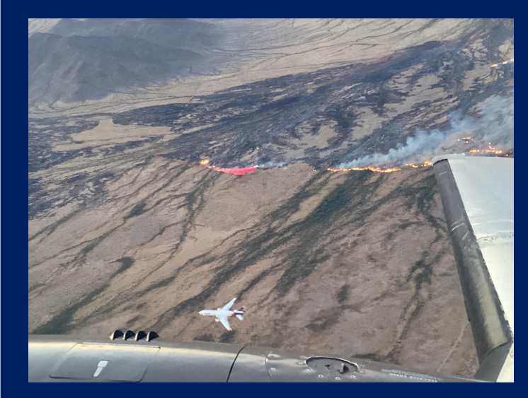
State Air Attack providing watch during VLAT drop on Flying Bucket Fire, southwest of Maricopa.